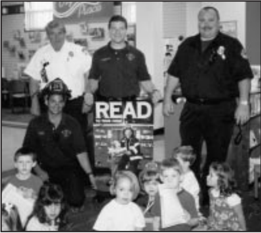
Fireman Fred & Friends visit the children's room