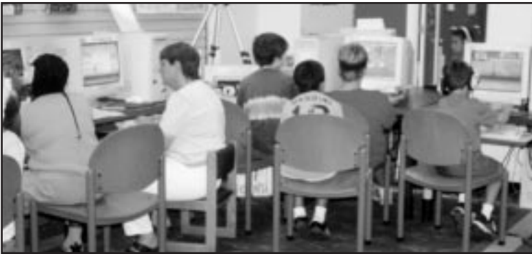
Computer users crowd Giga's Place daily during the summer