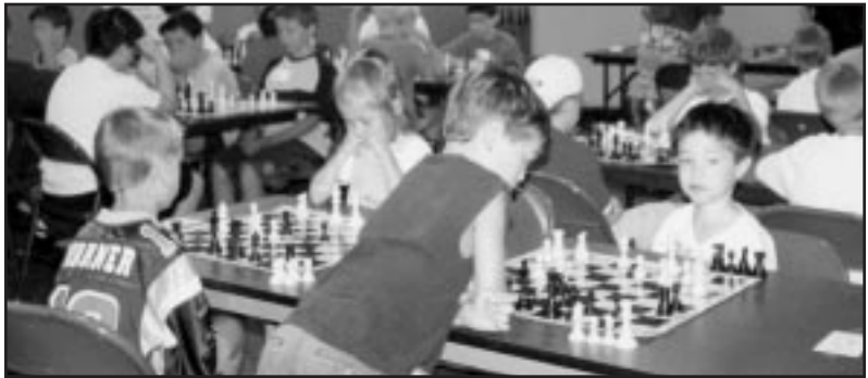
Annual chess tournament