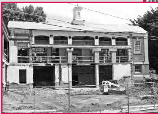
Back of building, July 2009

The city passed a $130,000 bond issue in 1955 for a new addition and equipment, plus an additional $25,000 for an auditorium. This addition doubled the floor space but the library outgrew the space before the dust settled. A second addition was built in 1964.