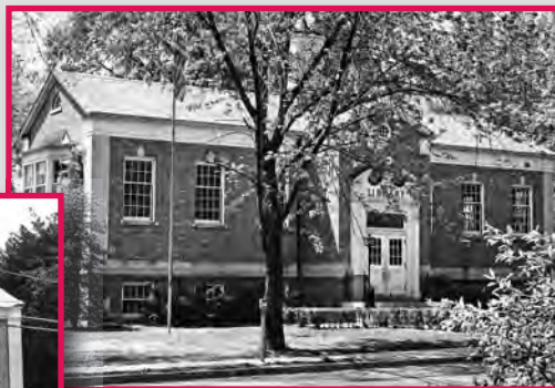
Kirkwood Public Library, 1949.

In 1994, library supporters voted for a tax levy increase, from 13 cents to 24 cents. This meant the library would now open to the public on Sundays for the first time in its history, keeping one of the promises made before the election. In recent years, though the library's original building and its two additions (1954 and 1963) remained structurally sound, the electrical, plumbing, fire protection, security and heating and cooling systems were found to be inadequate and in need of replacement.